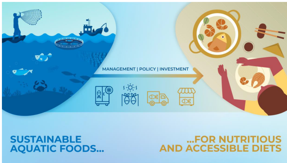
Figure 1. An integrated aquatic food systems approach, illustrating the whole value chain from sustainable capture fisheries and aquaculture [including small-scale capture fisheries and aquaculture (SSFA)] through processing, transport, and marketing, all the way to nutritious meals for consumers.

while simultaneously acknowledging the potential for growth in aquaculture (FAO 2022a).