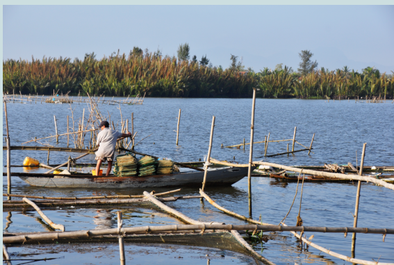
Fish farming in Hoi An, Cam Thanh region, Vietnam. As in Myanmar, thousands of farmers in Vietnam lose their production due to natural disasters.

Aquaculture, while rapidly expanding, often lacks financial risk management tools that are common in other food production sectors. Small-holder aquaculture producers face significant risks due to environmental factors like floods, which can severely impact yields and revenues. In Myanmar, a study by Watson et al. (2018) developed a cooperative indemnity insurance scheme tailored for small-holder fish farmers to mitigate these risks. The cooperative insurance model involves farmers pooling funds into a mutual fund that provides payouts in the event of losses due to floods. This self-organized risk pool leverages the strong social capital within farming communities, reducing administrative costs and helping to mitigate issues