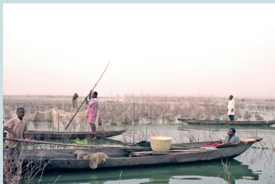
Acadjas are a traditional West African aquaculture technique in which submerged tree and shrub branches create artificial habitats that promote the growth of certain fish species in lakes and lagoons.

Aquaculture governance faces unique challenges due to the sector's vast diversity in production systems, species, and environments. Unlike other large food production systems, aquaculture produces hundreds of species in various contexts—from freshwater ponds and raceways to offshore mariculture—leading to a diversity of governance needs and challenges. This diversity results in countries exhibiting under-regulation, over-regulation, or a lack of cohesive policies altogether. One primary challenge is managing shared environmental resources or 'commons,' such as water quality and quantity, physical space, and genetic diversity. These resources often create collective action problems where individual interests (e.g., maximizing production) conflict with collective