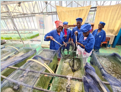
An aquaculture training course for a group of West African women at the Art Sunu Gueej aquaculture platform, financed by CAOPA (African Confederation of Professional Artisanal Fisheries Organizations).

As value chains and transactions become increasingly digitized, many rural stakeholders face a growing risk of exclusion and marginalization from essential information and opportunities due to systemic barriers such as low literacy and the cost of technology, data, and power. To address this, WorldFish, in partnership with Learn.ink—a training and learning digital platform designed for use on low-end mobile devices—has developed various training courses. For instance, an online learning curriculum was created specifically for remote extension workers in fish farms. Utilizing a hybrid ‘train-the-trainer’ model, local project staff were empowered to deliver training to rural fish farmers on how to use relevant digital resources and tools to identify disease outbreaks, collect biological samples, and implement measures to mitigate the