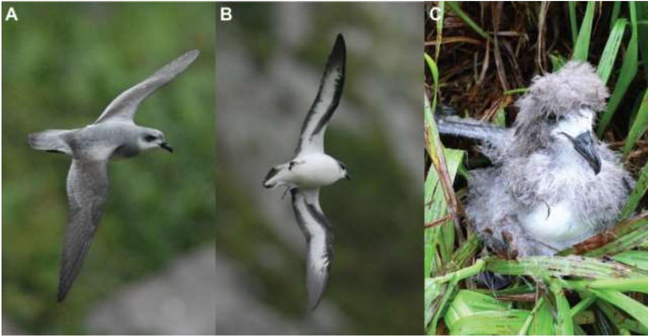
Fig. 3. Black-winged petrel Pterodroma nigripennis on Matthew and Hunter Islands (IRD/P. Borsa). Dorsal (A) and ventral (B) views of adult in flight, showing plumage patterns, January 2009. (C) Late stage of chick, with down remains and flight feathers underneath, April 2008.