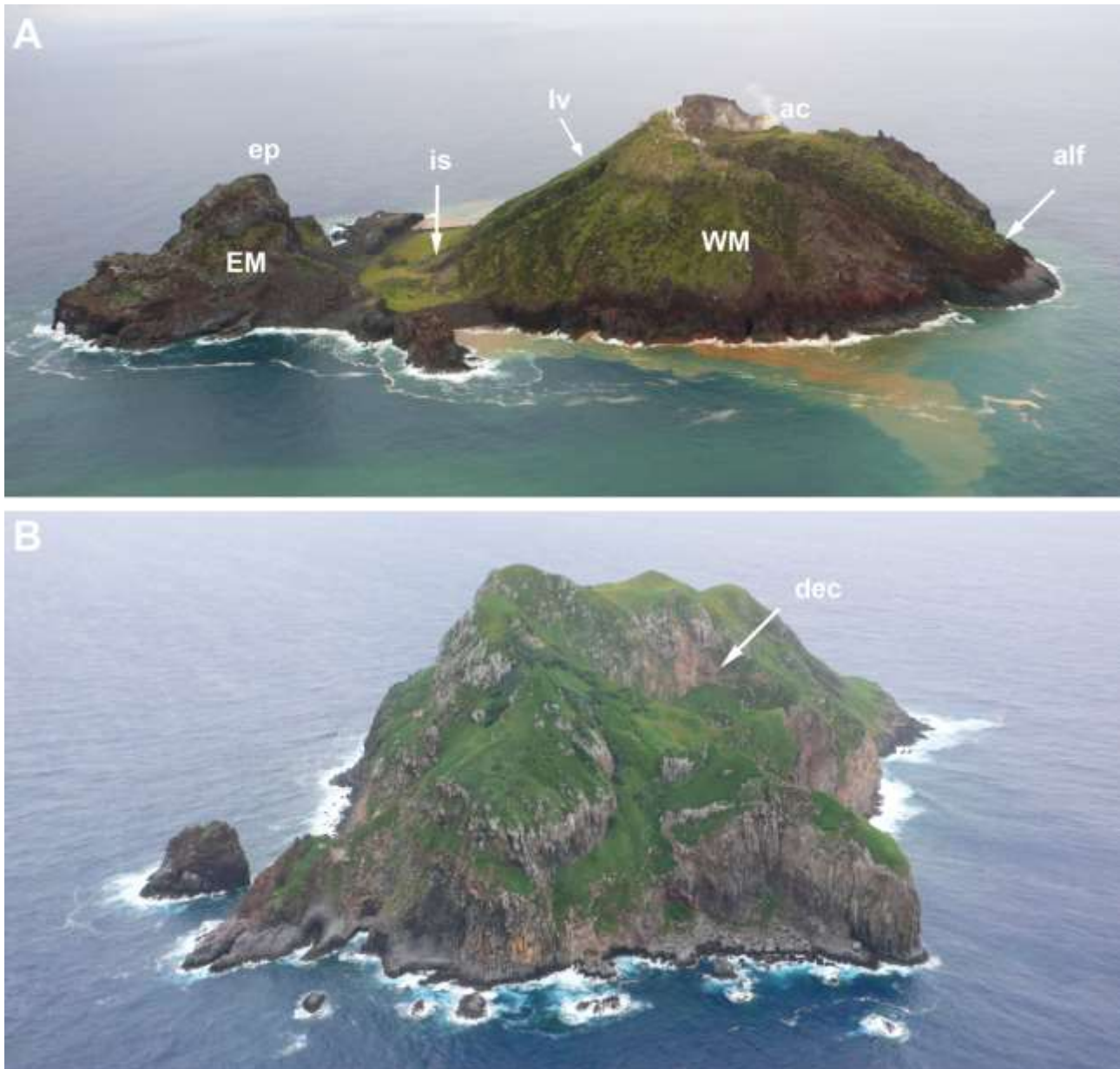
Fig. 2. Aerial view of the two study sites. (A) Matthew Island ( 22^{\circ}20'S , 171^{\circ}19'E ) seen from its North-West; ac active crater; alf aa-lava flow; EM East Matthew; ep eastern peak; is isthmus; lv lateral vent and radial gorge; WM West Matthew (IRD/P. Borsa; 17 Apr. 2008). (B) Hunter Island ( 22^{\circ}24'S , 172^{\circ}03'E ) seen from its North-West; dec deep explosion crater. (IRD/P. Borsa; 20 Jan. 2009).