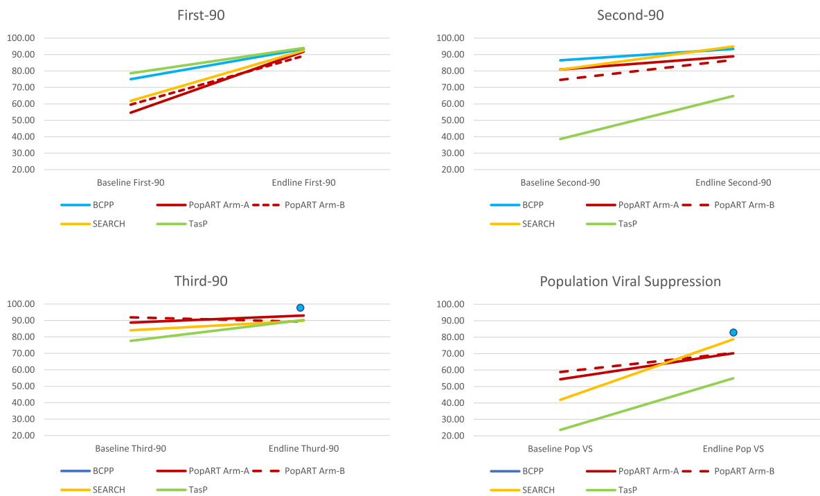
Fig. 1 a Baseline vs Endline 90-90-90 and viral suppression estimates. b Differences made to 90-90-90 and population viral suppression estimates from baseline to endline