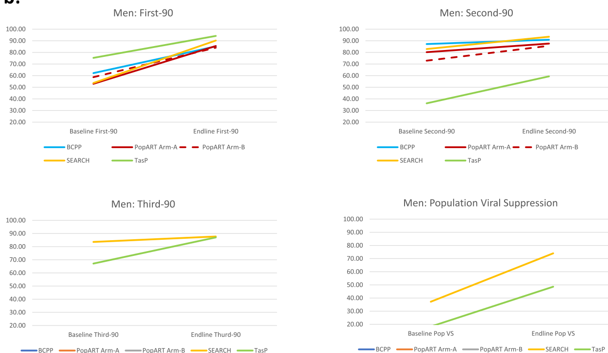
Fig. 2 a Difference made to 90–90–90 coverage and population viral suppression estimates from baseline to endline among women. b Difference made to 90–90–90 coverage and population viral suppression estimates from baseline to endline among men