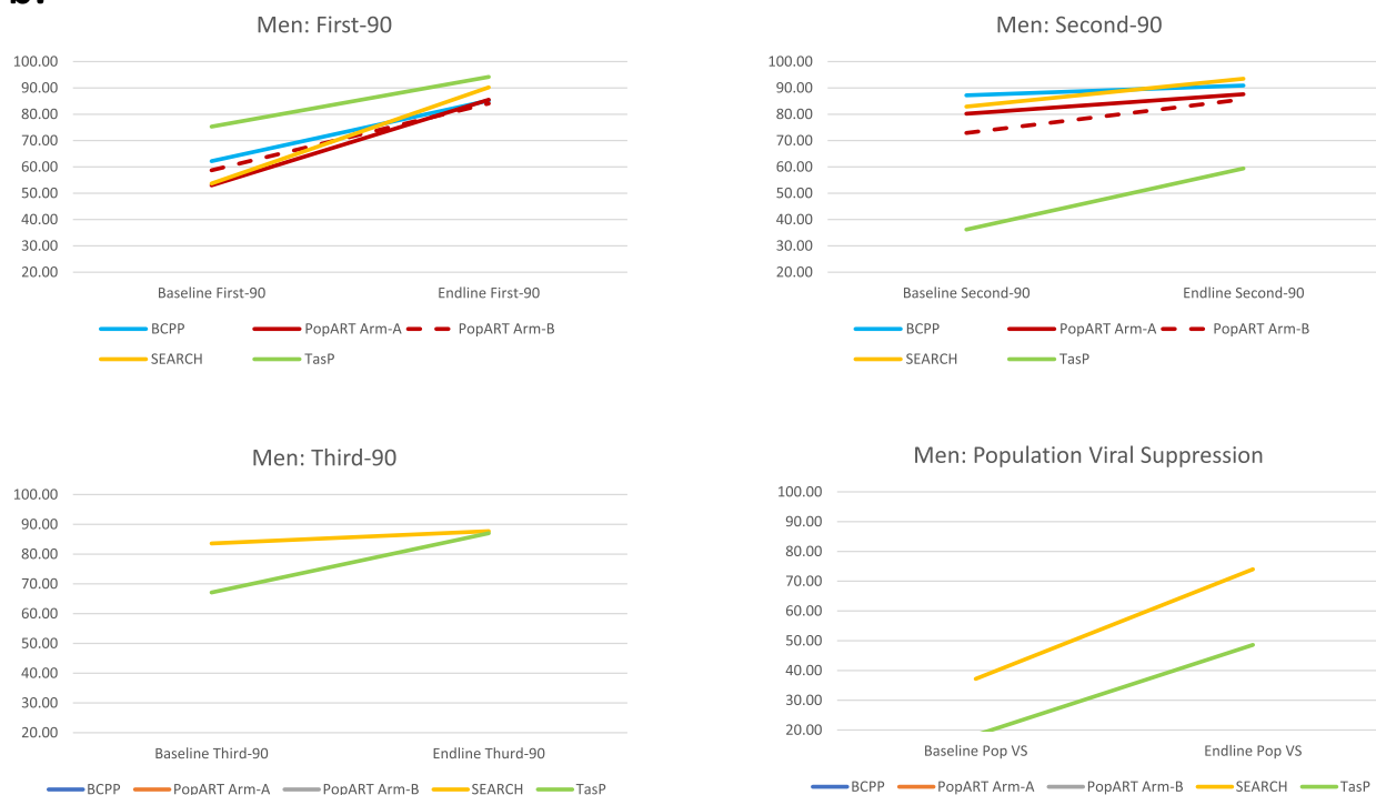
Fig. 2 a Difference made to 90–90–90 coverage and population viral suppression estimates from baseline to endline among women. b Difference made to 90–90–90 coverage and population viral suppression estimates from baseline to endline among men