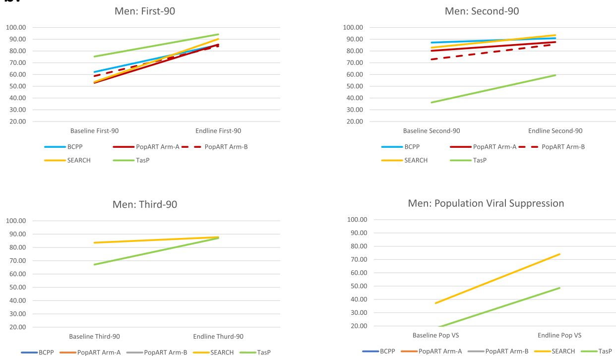
Fig. 2 a Difference made to 90–90–90 coverage and population viral suppression estimates from baseline to endline among women. b Difference made to 90–90–90 coverage and population viral suppression estimates from baseline to endline among men