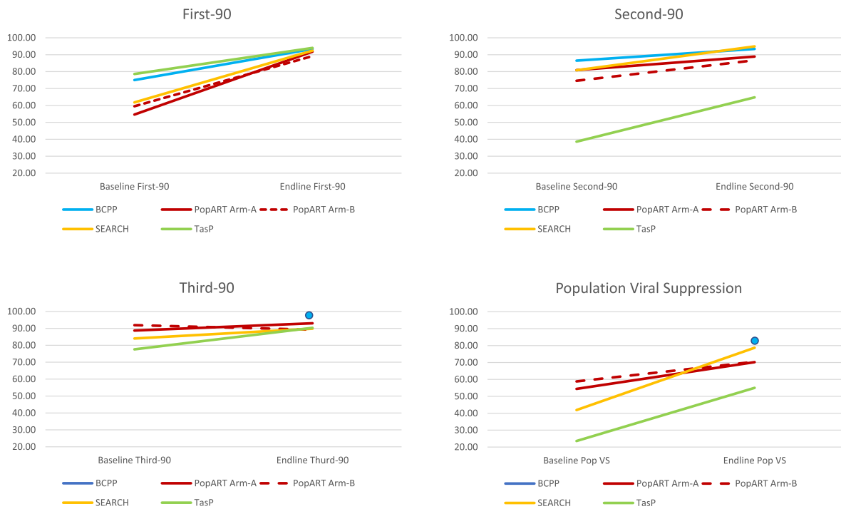
Fig. 1 a Baseline vs Endline 90–90–90 and viral suppression estimates. b Differences made to 90–90–90 and population viral suppression estimates from baseline to endline