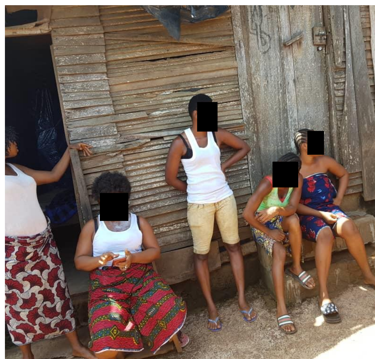
Sex work site