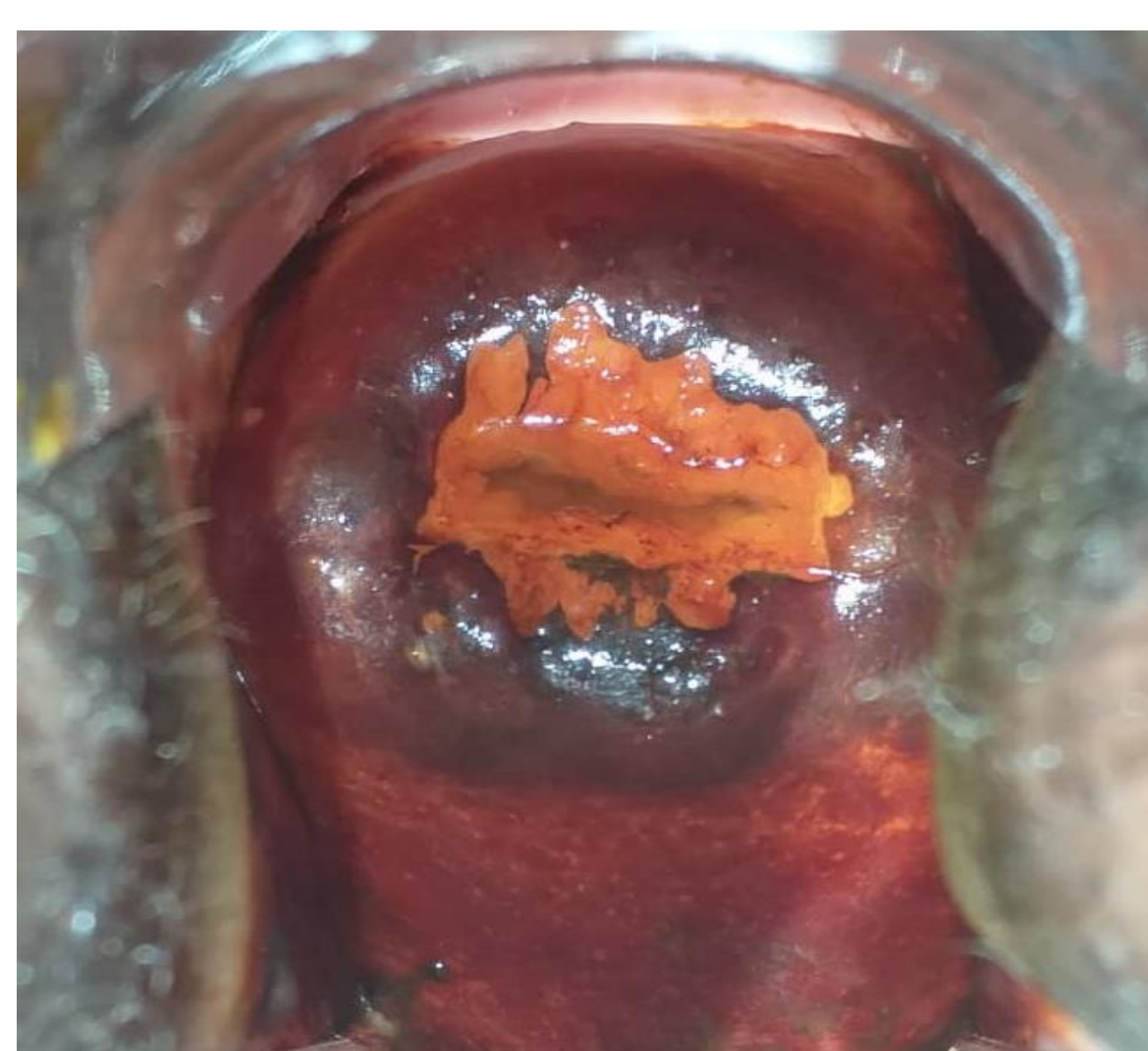
Precancerous cervical lesion