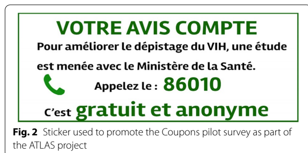
Fig. 2 Sticker used to promote the Coupons pilot survey as part of the ATLAS project

However, at the end of March 2020, a few days after COVID-19 was declared to be a global pandemic, survey participation decreased considerably and remained relatively low until the end of the pilot study. The COVID-19 pandemic forced the operational team to adapt their activities by entirely interrupting or reducing outreach activities, which drastically reduced the number of HIVST kits distributed and, concomitantly, severely limited the number sticker invitations in circulation.