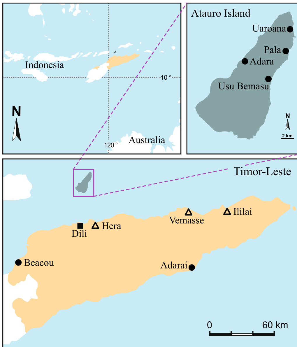
Fig. 1 Map of community sites surveyed throughout Timor-Leste. Solid circles represent communities where focus group discussions and fishing diary data were collected. Hollow triangles represent communities where only focus group discussions were conducted

occurrence of each species in the total number of samples, summed over all species groups from j = 1 to 6.