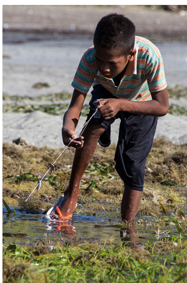
Fig. 4 A Timorese boy fishing in a seagrass flat with a small hawaiian sling ( kilat ki'ik ).

and then attempting to sell it. However, these results are insufficient to make conclusions. Mollusc and crab species represent a nutritious element of Timorese subsistence diets, but only a small number of species are targeted for commercial purposes. 84% of bivalves and gastropods species were exclusively for home consumption and played an important role to secure household protein, particularly in times of shortage and bad weather. They are available throughout the year and their distribution is relatively predictable (Thomas 2007), so decisions regarding their harvest are not necessarily determined by availability, but rather rely upon continuous tallying and assessment of all potential food resources; the dynamic reappraisal of changing food values and ease of procurement; as well as the changing estimates of group needs (Waselkov 1987). Crabs and shelled molluscs play an important role in food security, and gleaners are the primary agents in monitoring