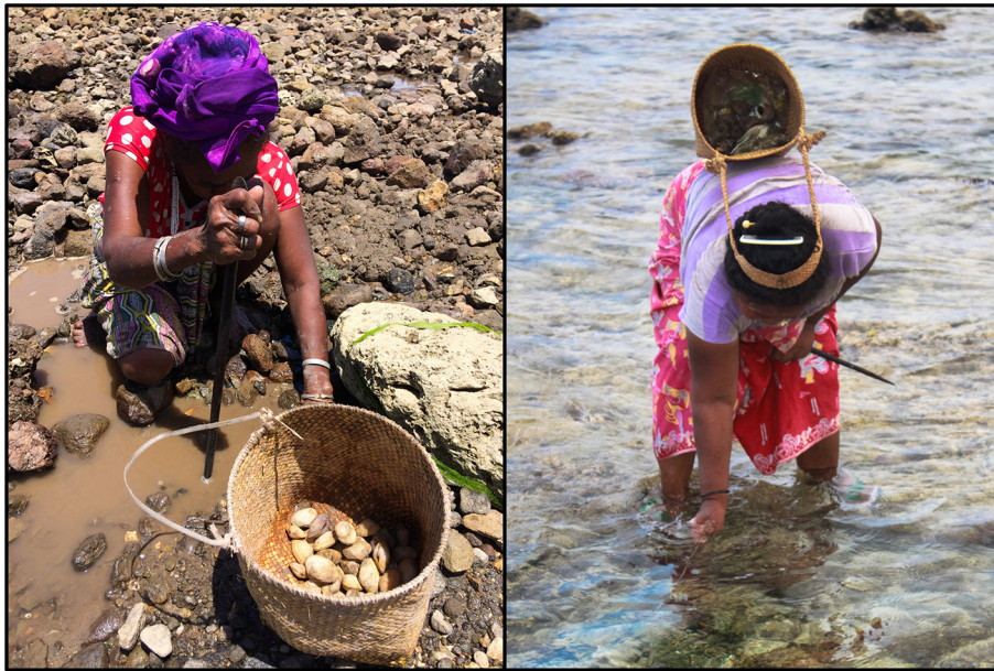
Fig. 2 Women gleaners: Digging for cockles Asaphis violascens (left pane) and probing for octopus at low tide (right pane).