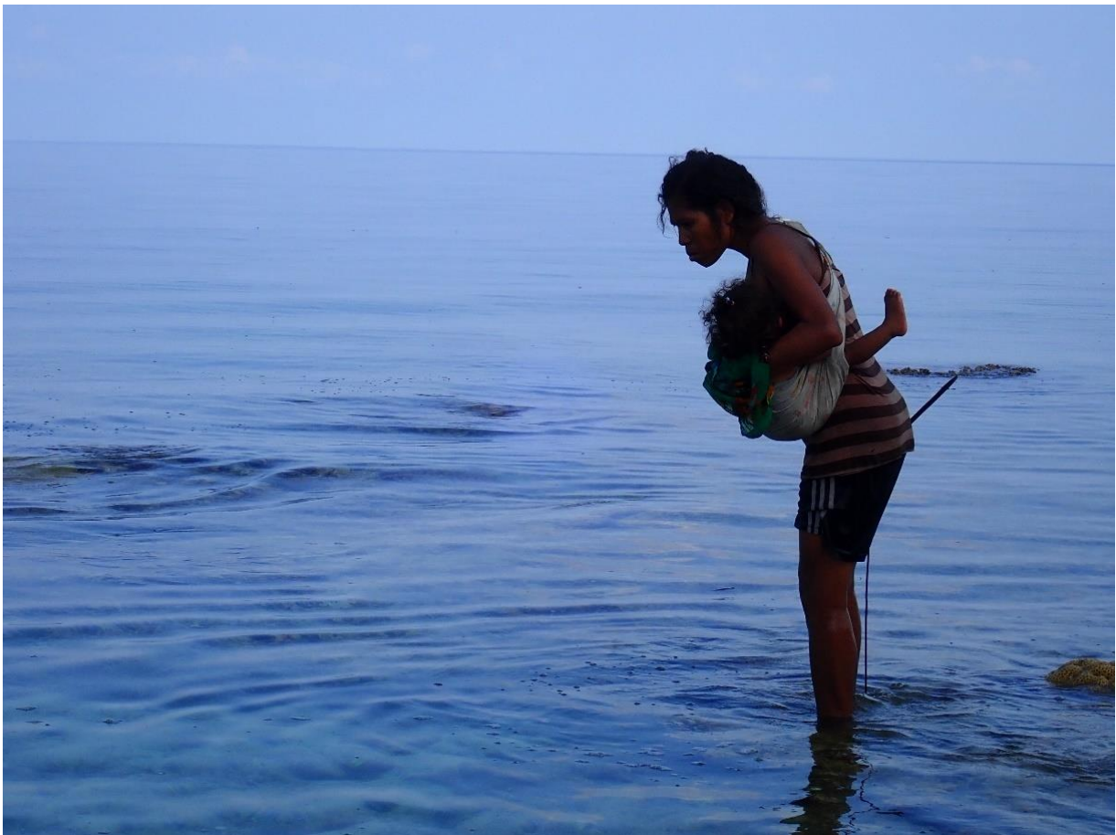
Figure 2: Women play a key role harvesting molluscan species in intertidal environments.

The social structure and organization of shellfishing activities displays gendered and intergenerational particularities. Women are the main gatherers of shells in the seashore (Figure 2), while men fish mainly in areas that are permanently submerged regardless of the tide, and target large molluscan species such as Tritonia charonis , Tectus niloticus and Turbo marmoratus . These species are sought after mainly for the economic and cultural value of the shell, more than being target for edible purposes. Children can be seen accompanying their mothers during gleaning activities. They also play an important role finding small empty shells washed up on the beach, mainly gastropods, that are turned into necklaces or earrings by their mothers and sold during the Saturday market at Beloi. Women are the main sellers of molluscs, both for food or for ornamentation purposes.