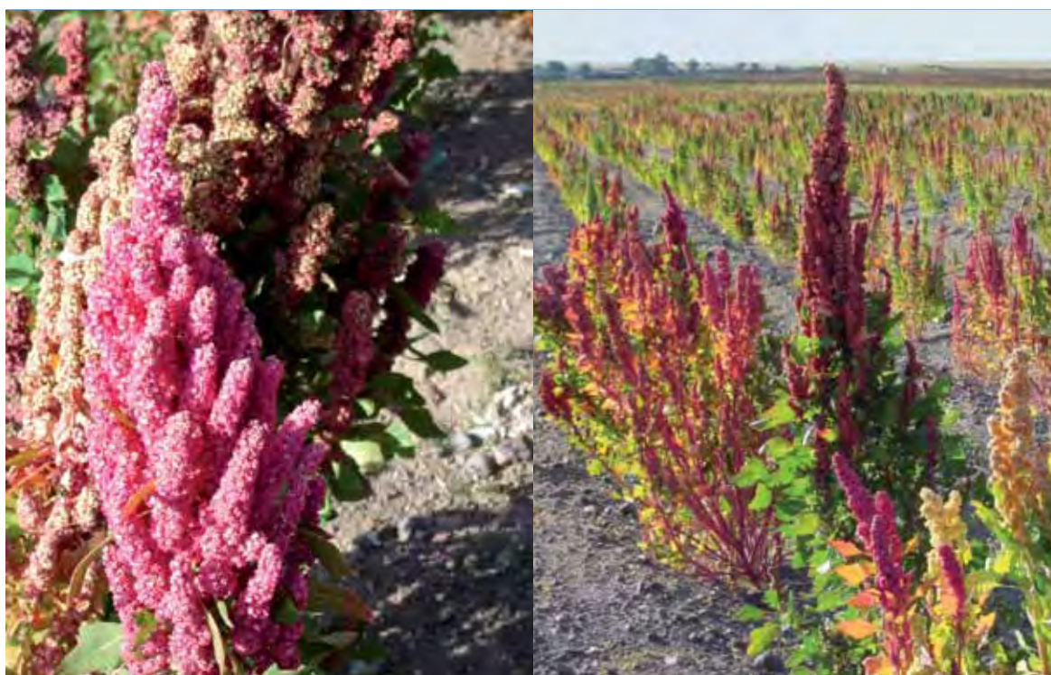
FIGURE 2 Flower and grain colour presented in the figure are only an example. Depending on the quantity of anthocyanins, this colour varies from green-yellowish to deep purple and even black throughout quinoa cultivars.

In midseason, quinoa reaches maximum canopy cover ( CC_x ), shortly after first anthesis. CC_x is largely dependent on the management conditions and, to a large extent, determines quinoa transpiration. For a complete canopy cover of the ground and under non-limiting nutrient conditions, quinoa transpires at a rate similar to the reference evapotranspiration ( ET_0 ). Seasonal ET values for quinoa with a normal season length of 150-170 days are around 500 mm under non-stressed conditions. As a C_3 crop, normalized crop water productivity ( WP^* ) is low,