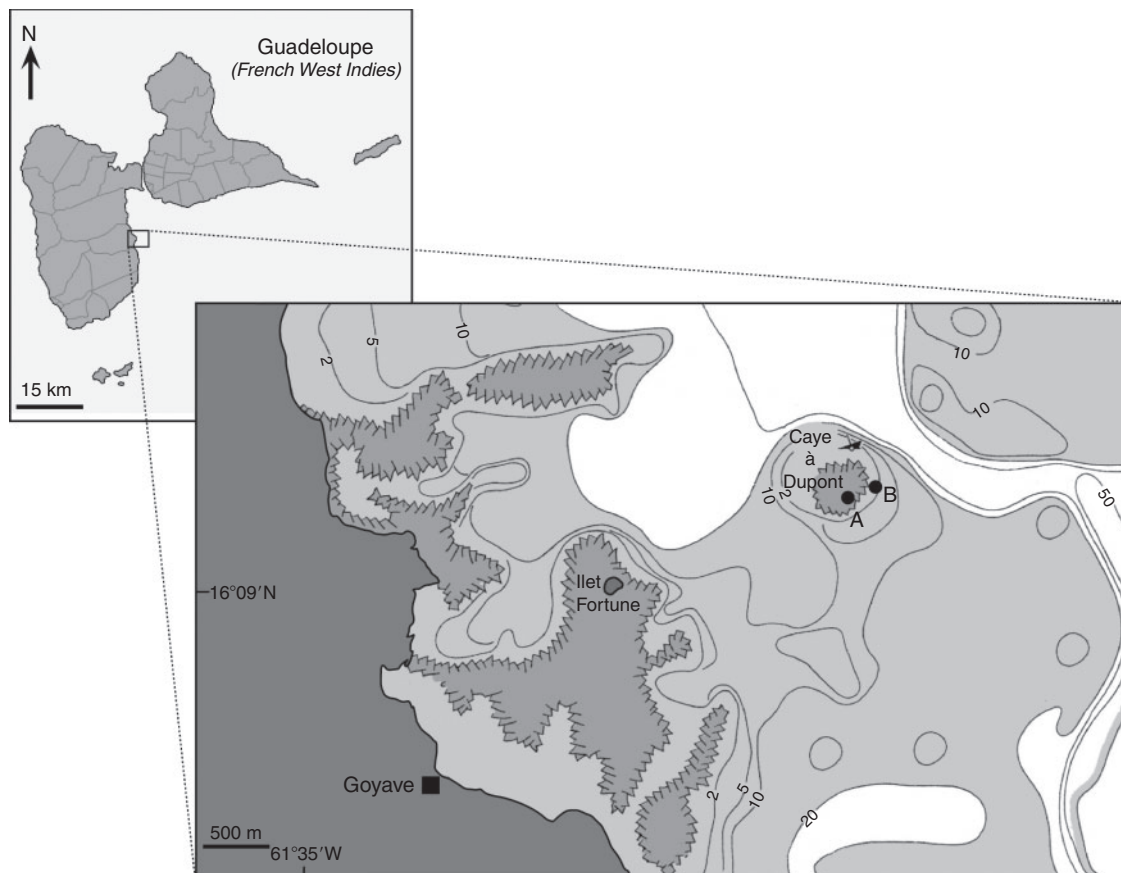
Fig. 1. Location of the Caye-à-Dupont study site and sampled Acropora populations in Guadeloupe. (a) A. cervicornis ; (b) A. palmata .

Genomic DNA was isolated from 5–10 polyps per individual colony using a DNA Purification Kit (formerly Genra Puregene, Qiagen, Germantown, MD, USA) following the manufacturer’s protocol. Forward primers of A. palmata specific microsatellite loci (Baums et al. 2005, 2009) were labelled with ABI fluorescent dyes and 14 loci were successfully amplified into two multiplex PCRs as follows: Multiplex1: 0007/NED, 0166/PET, 0192/6-FAM, 0207/VIC, 1195/PET, 2637/VIC, and 5047/NED; Multiplex2: 0181/NED, 0182/PET, 0513/6-FAM, 0585/VIC, 1490/PET, 6212/NED and 9253/VIC. Multiplex PCR reactions were conducted in a thermocycler (GeneAmp PCR System 2700, Applied Biosystems, Foster City, CA, USA) in a final volume of 10 µL using the Type-it Microsatellite PCR Kit (Qiagen) according to the manufacturer’s protocol, and using an annealing temperature of 57 and 55°C for Multiplex 1 and 2 respectively. Amplified fragments were sent to Genoscreen (Lille, France), where they were resolved on an ABI 3730XL sequencer along with a GeneScan LIZ-500 internal size standard (Applied Biosystems). GENEMAPPER 5.0 software (Applied Biosystems) was used to genotype all screened individuals.