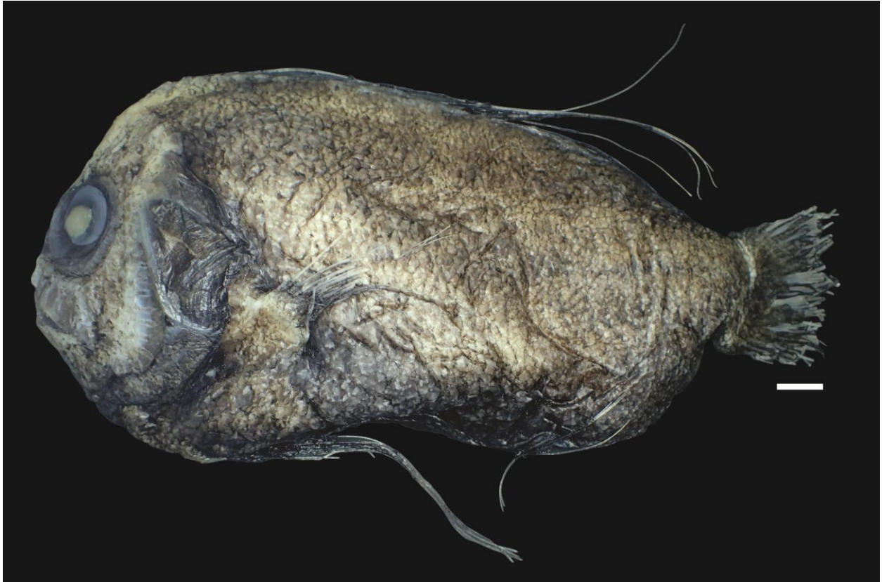
Figure 1. Paracaristius nudarcus (NPM 4476, 165 mm SL). Scale = 10 mm.