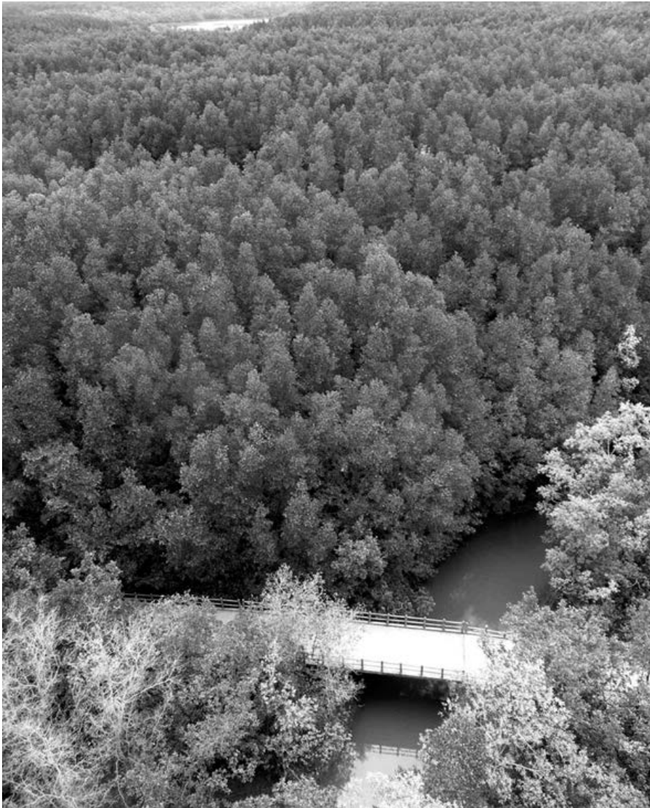
Figure 2 : Photo of the Vietnam mangrove forests: the contrasted mangrove-scape testifies the contrasted management regime CanGio mangrove, South Vietnam

and to protect the mangrove forest. To-day, there are 160 protective families, every family is responsible of on average 80 ha (the smallest protected forest is 25 ha and the biggest, 300 ha). They could conserve their charge as long as they fulfill their duty.