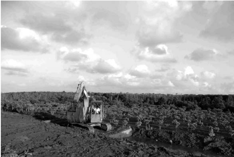
Figure 3 : Xuan Thuy mangrove, North Vietnam In CanGio as in Xuan Thuy mangroves (Fig. 3), in spite of the differences of regime (strict control versus lack of management), we raise a game of powers between the representatives of the central and provincial government, the protective families or endowed with concessions, the foreign and migrant users and, at the same time, a strong social dynamics with the enrichment of certain actors (new traders in CanGio, stemming from protective families; breeders of clams in Xuan Thuy). In the CaMau mangroves, Ha et al (2011) point out a similar imbalance in access to finance, markets, and differences in authority between the two actors, farmers and State Forest Companies. This expresses the unequal distribution between first inhabitants and immigrants, as well as among privileged government officers and farmers.

acuteness the question of the legal status of mangrove: are they pioneer fronts, in the limits ceaselessly moved forward in the maritime infinity, as the mangrove of Madagascar or the North Vietnam, converted into shrimp ponds? Are they amphibian gardened spaces in the hands of peasant-fishermen's communities as the mangrove terroir of Northern Rivers? Or are they still wild sanctuaries, refuges habitats for numerous botanical and animal species in danger as the mangrove of Guiana? Besides, to whom belong mangroves? Are they local, national or world heritage? Who are the beneficiaries? To whom return the benefits of the conservation of their services?