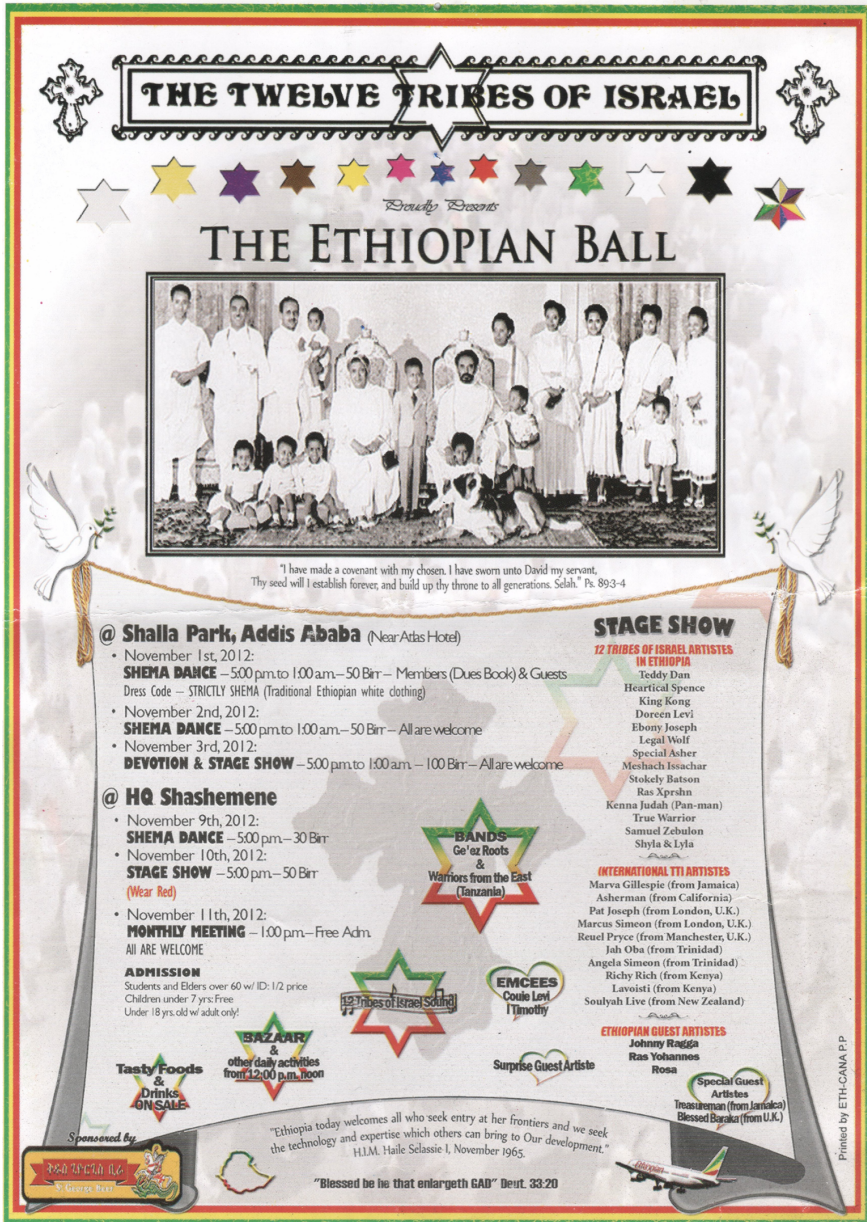
FIGURE 2 Poster of the Shama Ball, November 2012, Addis Ababa, Ethiopia