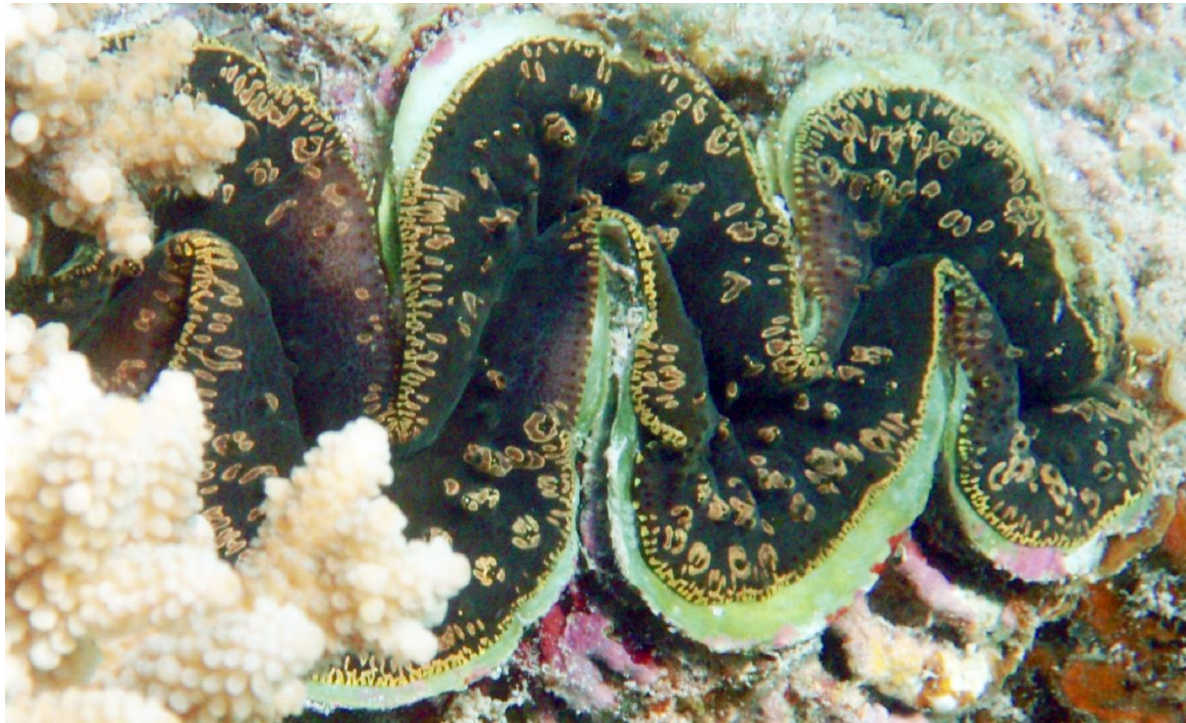
Fig. 2. Tridacna noae (Röding, 1798) on the reef in Coral Bay, Western Australia, 23°09'S 113°47'E, 14 August 2008 (photographed by: Tsun-Thai Chai).