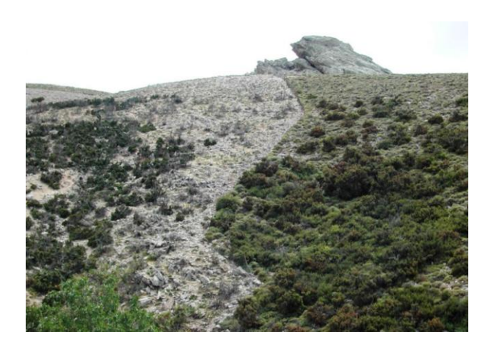
Fig. 3 Grazing land belonging to two farmers and subjected to grazing intensity

management practices and techniques for combating desertification. The proposed methodology provides a series of effective indicators that would help people to identify where land desertification is a current or potential problem, and which could be the actions to alleviate the problem over time. For the application the following steps must be followed: (a) choose the appropriate land use (agriculture, pasture, forest) (Table 4), (b) decide for the land degradation process or cause (water erosion, tillage erosion, sol salinization, etc.) for selecting the appropriate equation (Table 5), (c) define the data and the appropriate indices of the corresponding indicators (Table 2) and introduce to the equation, and (d) calculate the DRI. The derived methodology can be easily used through the expert system loaded in the DESIRE website available at: http://www.desire-his. eu/en/assessment-with-indicators/wp22-evaluation-a-shortlist-of-indicators-thematicmenu-174/66-study-site-indicators.