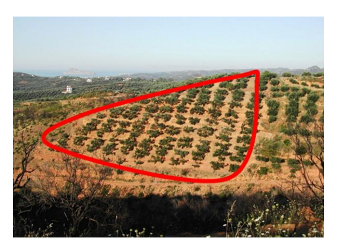
Fig. 2 Example of study field site (sampling point) with defined soil, topography, land use, and land management characteristics belonging to a certain farmer

number of candidate indicators used for the analysis in each process or cause ranged from 16 to 50. A forward stepwise multiple regression analysis was applied using desertification risk as the dependent variable and the candidate indicators assigned for each process as independent variables, using the following linear model (Steel and others 1997):