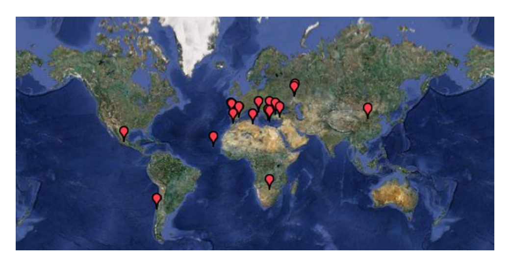
Fig. 1 Distribution of the investigated study sites

thematicmenu-173/160-manual-for-describing-land-degrada tion-indicators).