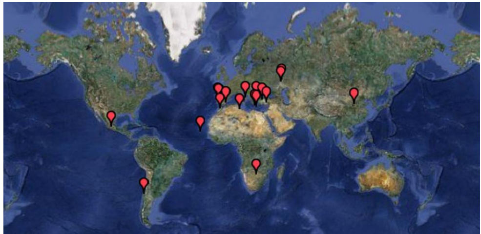
Fig. 1 Distribution of the investigated study sites

thematicmenu-173/160-manual-for-describing-land-degradation-indicators ).