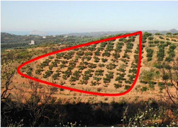
Fig. 2 Example of study field site (sampling point) with defined soil, topography, land use, and land management characteristics belonging to a certain farmer

number of candidate indicators used for the analysis in each process or cause ranged from 16 to 50. A forward stepwise multiple regression analysis was applied using desertification risk as the dependent variable and the candidate indicators assigned for each process as independent variables, using the following linear model (Steel and others 1997):