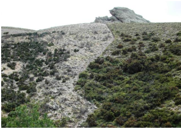
Fig. 3 Grazing land belonging to two farmers and subjected to grazing intensity

management practices and techniques for combating desertification. The proposed methodology provides a series of effective indicators that would help people to identify where land desertification is a current or potential problem, and which could be the actions to alleviate the problem over time. For the application the following steps must be followed: (a) choose the appropriate land use (agriculture, pasture, forest) (Table 4), (b) decide for the land degradation process or cause (water erosion, tillage erosion, soil salinization, etc.) for selecting the appropriate equation (Table 5), (c) define the data and the appropriate indices of the corresponding indicators (Table 2) and introduce to the equation, and (d) calculate the DRI. The derived methodology can be easily used through the expert system loaded in the DESIRE website available at: http://www.desire-his.eu/en/assessment-with-indicators/wp22-evaluation-a-short-list-of-indicators-thematicmenu-174/66-study-site-indicators . After defining desertification risk, the land user has the ability to change values of indicators related to land use and land management practice for establishing promising conservation strategies for reducing desertification risk at field or regional level. As described by Karavitis and others (this issue) a computer application has been developed that allows users to calculate desertification risk based on the equations that have been developed.