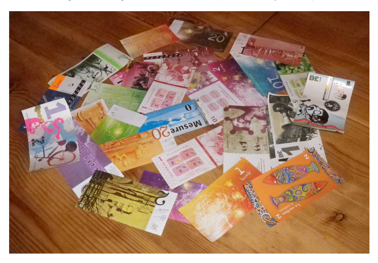
Figure 2. Examples of vouchers of CCS (illustration by authors)