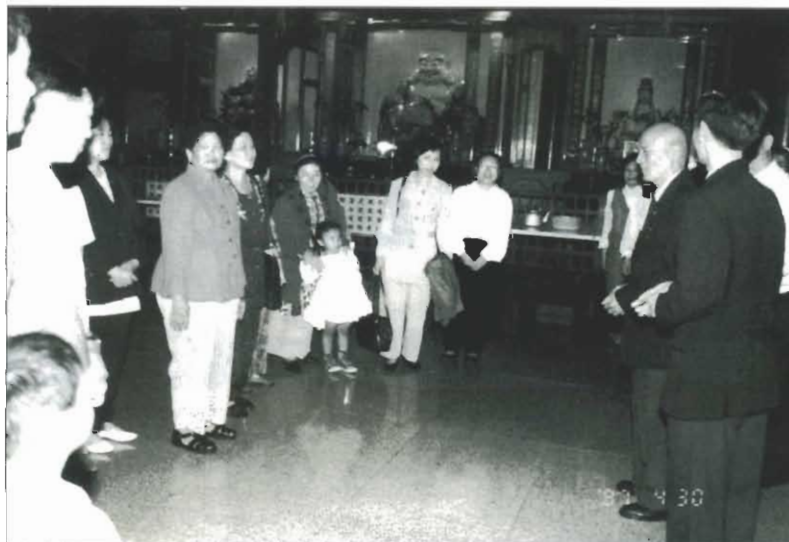
Thai devotees visit temple Level one: Milefo (centre)

The three female divinities, Guanyin , Mazu and Wusheng laomu are protective and compassionate feminine figures. In this respect, there is no visible difference between the practices of a Yiguan dao temple and a popular local one. The distinctive features emerge as one goes up through the levels, whose vertical arrangement reflects different degrees of religious understanding. The last two are reserved for the initiated: they are dedicated to Confucius, Lao Tse or Mencius and the Milefo incarnation of the Buddha. The spatial layout reflects the way the movement mentally represents to itself its hierarchy of divinities and philosophical doctrines. But this mental representation enjoys widespread endorsement, far beyond the circle of cult members. It is rooted in a vision of the world arising from Chinese tradition.