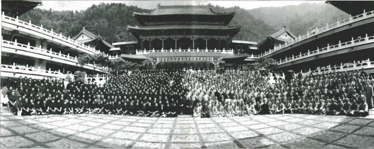
Gathering of Yiguan dao followers at the “Tianyuan Fo Yuan” Temple, Nantou District, to celebrate Wusheng Laomu

The development of trends concerning identity and political affiliation among the members of the Tiandi jiao and the Xuanyuan jiao provide a pertinent comparison with the Yiguan dao organisations (27) :