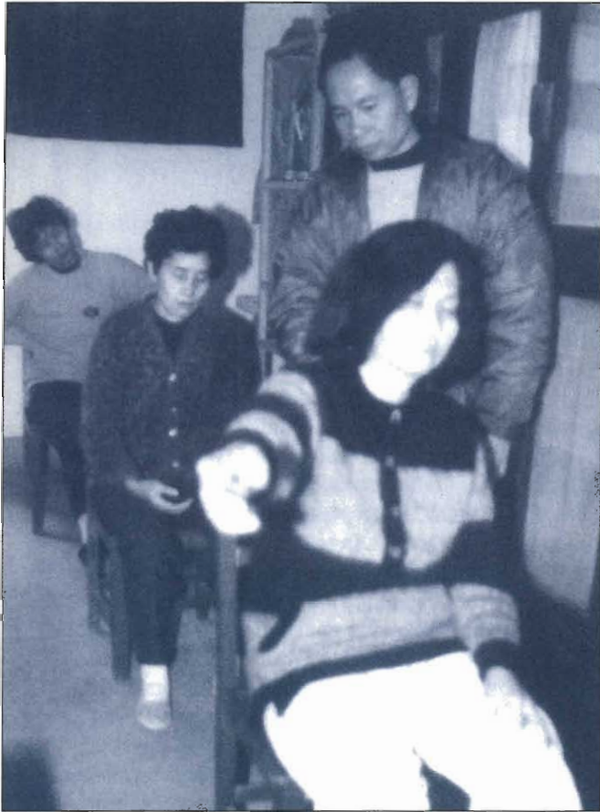
Collective consultation and qigong therapy: the patients are in a "qigong state": half awake, half asleep

effect within the person: there is no visible process of interaction between the adherents. While the aim is therapy by qigong , the beneficial qi of the master is transmitted into the patient's body. This technique, of treatment at a distance ( faqi , fagong : "to transmit the qi "), is part of the standard practice of qigong therapy. Liberating the emotions is a necessary form of behaviour to be receptive to the master's qi : adherents must show their emotional states without control or inhibition. Let us listen to the words of Master X (11) as he projects his qi during a session of collective treatment: "Relax. If you want to shout, then shout. If you want to laugh, laugh. If you're sad and you want to cry, then cry; to dance, then dance; to move, to practise movements, go ahead."