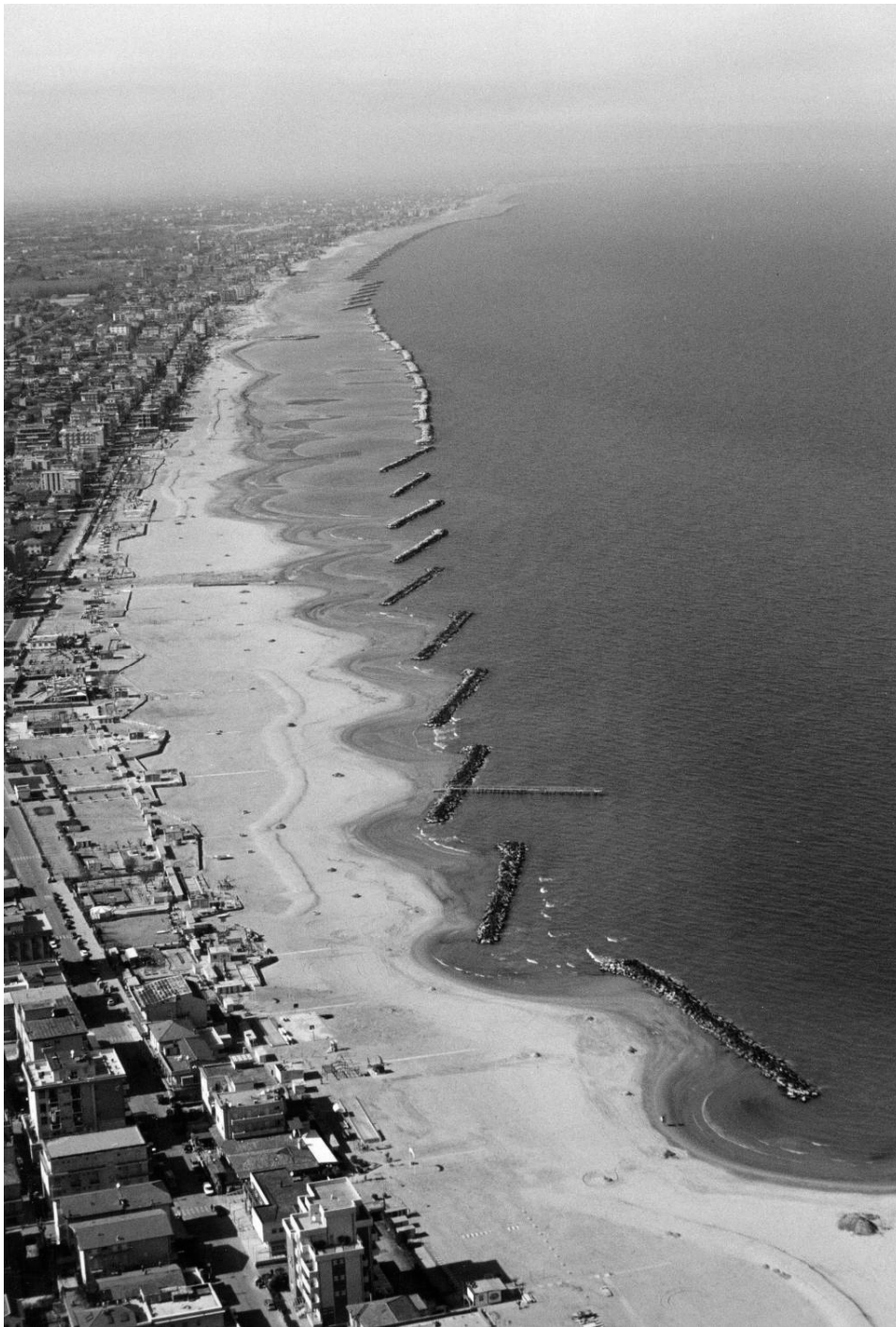
Figure 1: Aerial view of the urban structures along the coasts of the Adriatic Sea.