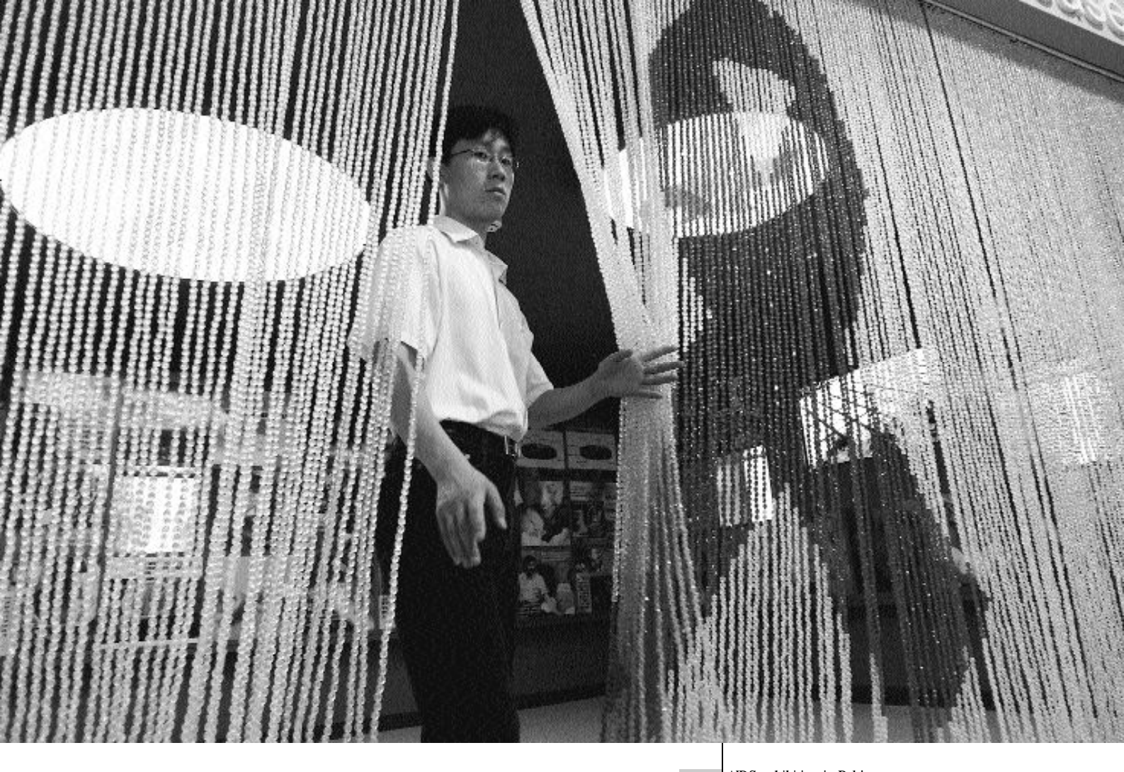
AIDS exhibition in Peking. The authorities now admit to not doing enough in the way of sex education

national agencies working on the spot in China, are being encouraged to co-ordinate their activities in order to improve efficiency.